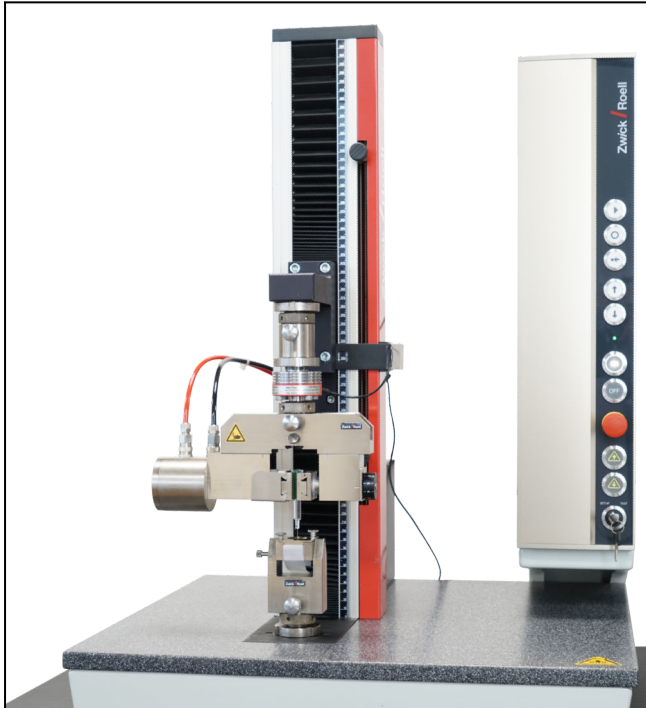
Test arrangement with pneumatic grips and holding fixture for special film