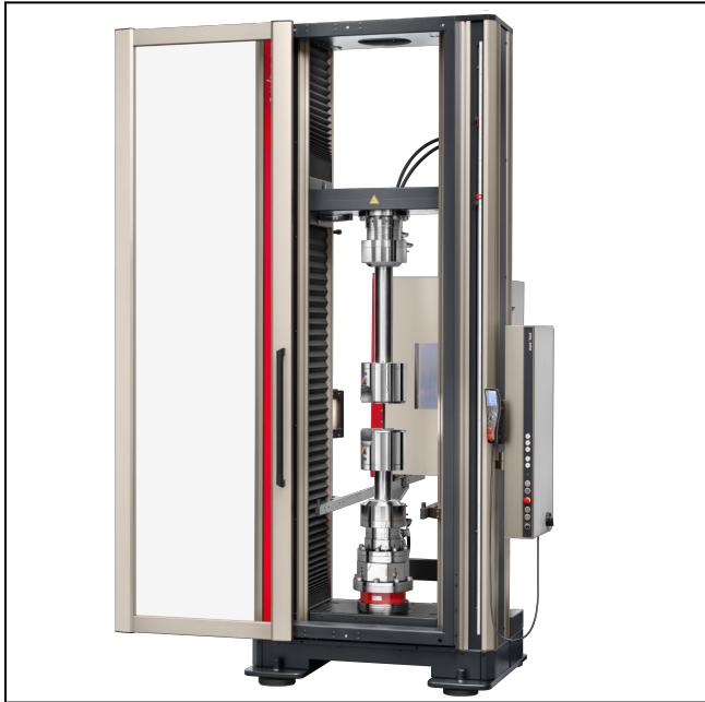
AllroundLine Z250 with temperature chamber